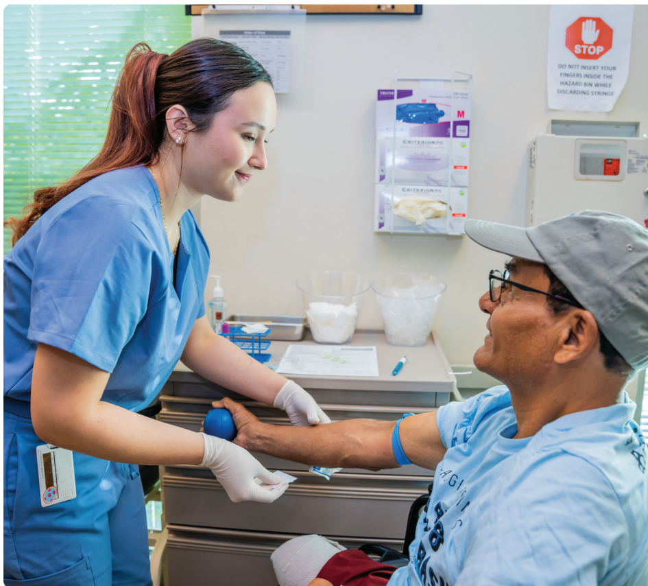
A Lab Technician draws blood from a patient at San José Clinic in Houston, TX

To donate, just use the enclosed envelope. Or to put your gift to work even faster, visit americares.org/SummerNews2024 . ❤️