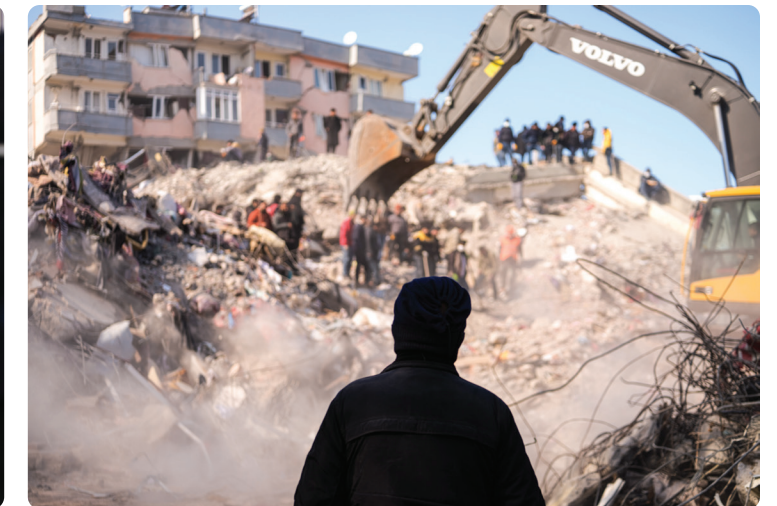
An earthquake survivor looks at the aftermath of the devastating 7.5 and 7.8 magnitude earthquakes that hit Syria and Türkiye.