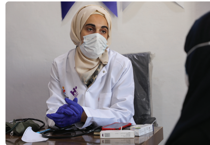
A health worker speaks with a patient at the AmeriCares-supported Al-Zohoor Primary Health Clinic in Northern Syria.